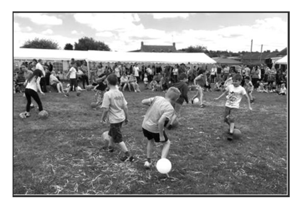
Fun at Salford Fete