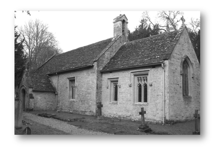
Verse of the Month - James 4:8

Good to Know: if you have children, you are of course most welcome to join us at any of the above services but we cater particularly for children (aged 0-11) each Sunday in Chipping Norton, Kingham and Churchill, and for youth (11-16) in Chipping Norton.